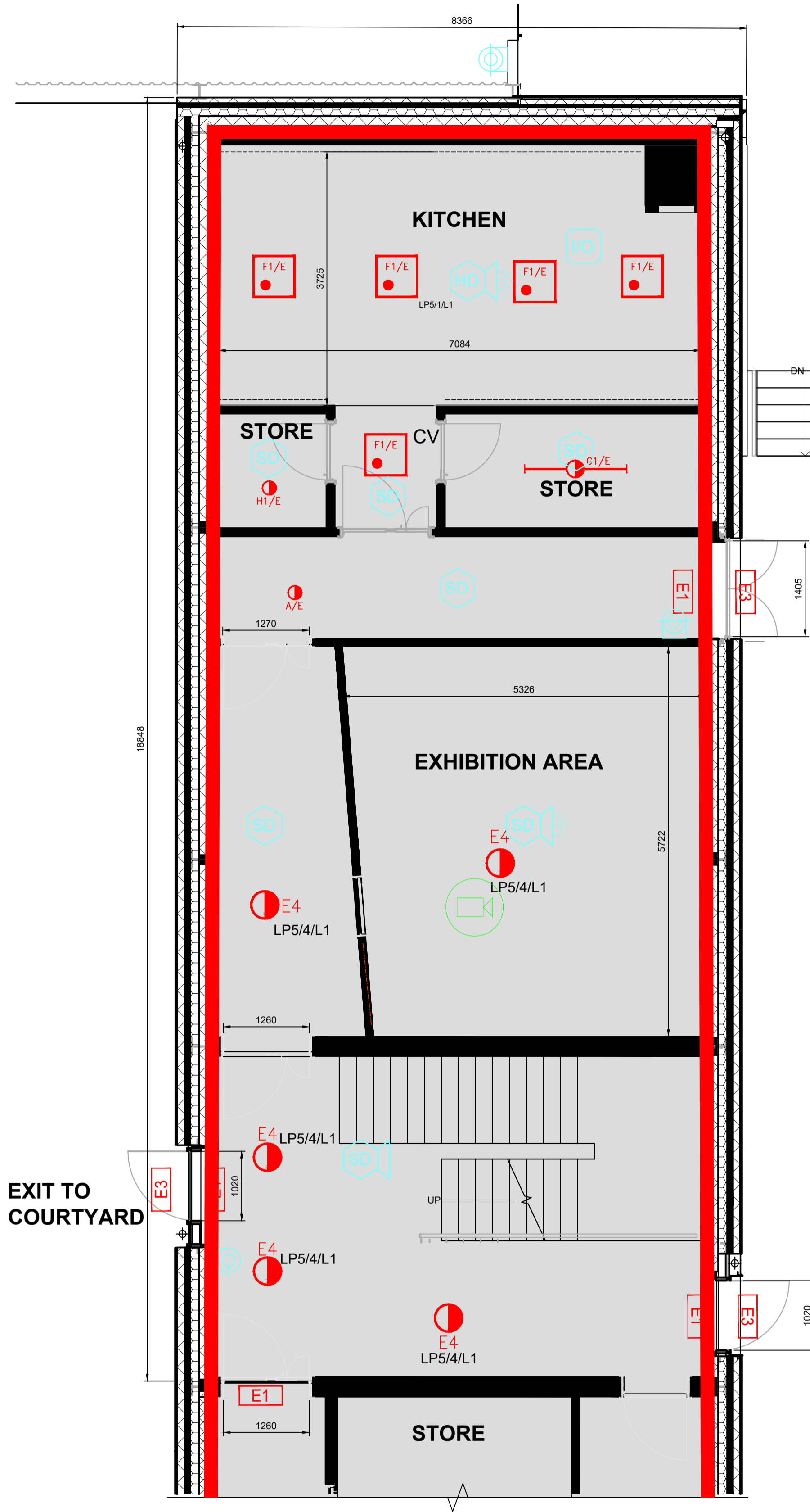
GROUND FLOOR PLAN PART PLAN NORTH 1:50